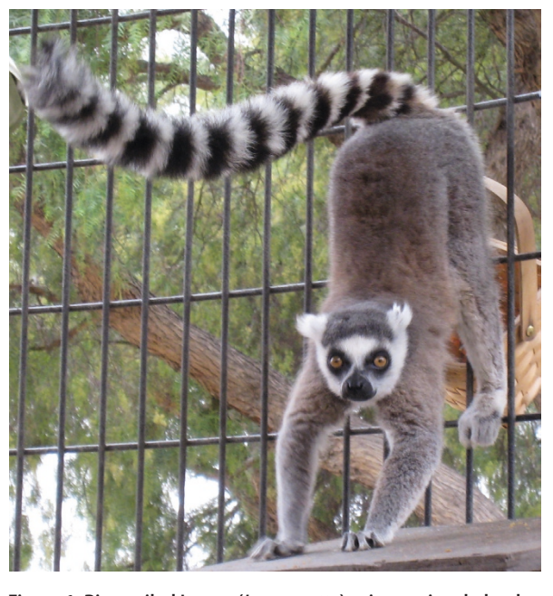
Figure 1. Ring-tailed Lemur (Lemur catta) using perianal glands for scent marking.

demonstrating a significant correlation between genetic similarity (estimated from 11-14 microsatellite loci) in a captive population of ring-tailed lemurs (Lemur catta) and similarity of volatile chemicals in their genital gland secretions, as assessed by gas-chromatography massspectrometry. The genetic similarity of two individuals is thus manifest in the odor profile (sometimes referred to as an 'odortype'). Even more intriguing, although the genital glands of the two sexes are anatomically distinct (scrotal glands in the male, labial glands in the female), this covariance between genetic and chemical similarity is evident even between individuals of the opposite sex. While some components are expressed only by animals of one sex, more than half (about 170) were expressed by individuals of both sexes. To provide a simple estimate of chemical distance between a pair of individuals, Boulet et