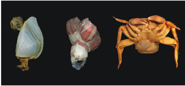
Figure 1 Representatives of Cirripedia. From left to right: a goose barnacle ( Thoracica , Lepadidae ); an Indo-Pacific giant acorn barnacle ( Thoracica , Balanidae ); and the externa of a parasitic Sacculina ( Rhizocephala ) sitting under the abdomen of a crab.

than a hundred years exclusively by its larval stages. With this study, the authors approach the solution of one of the last major riddles of the complex biology of thecostracan crustaceans, which has puzzled numerous zoologists over the past two centuries.